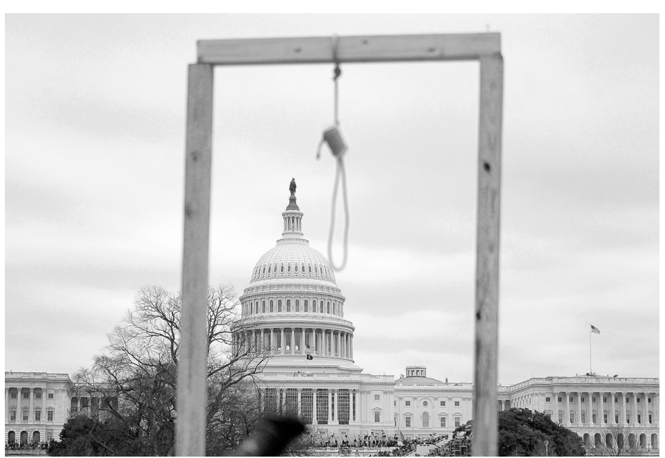
A noose is seen on makeshift gallows as supporters of US President Donald Trump gather on the West side of the U.S. Capitol in Washington DC on Jan. 6.

When asked during a debate last year to disavow support from the racist Proud Boys, Trump instead told them to "stand back and stand by." Even as the violence